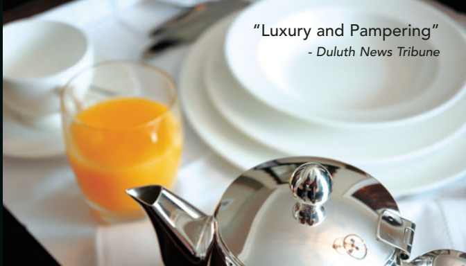
"Luxury and Pampering" - Duluth News Tribune

Meticulously appointed with one-of-a-kind antiques or original art. Every room is as individual as the guests who occupy them